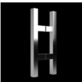
No.443 304 Grade satin stainless steelAvailable in pairs or half pairsAvailable for glass, wood or metal doorsDoor Thickness: 1 3/8" -2" standardDoor Thickness: 2" to 5"+ available Learn More