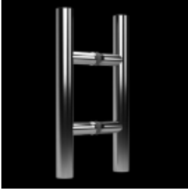
No.405 304 Grade satin stainless steelAvailable in pairs or half pairsAvailable for glass, wood or metal doorsDoor Thickness: 1 3/8" -2" standardDoor Thickness: 2" to 5"+ available Learn More