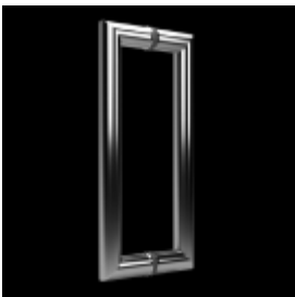
No.409 304 Grade satin stainless steelAvailable in pairs or half pairsAvailable for glass, wood or metal doorsDoor Thickness: 1 3/8" -2" standardDoor Thickness: 2" to 5"+ available Learn More