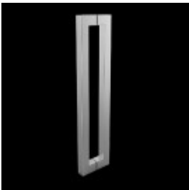
No.406 304 Grade satin stainless steel Available in pairs or half pairs Available for glass, wood or metal doors Door Thickness: 1 3/8" -2" standard Door Thickness: 2" to 5"+ available Learn More