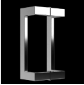
No.401 304 Grade satin stainless steel Available in pairs or half pairs Available for glass, wood or metal doors Door Thickness: 1 3/8" -2" standard Door Thickness: 2" to 5"+ available Learn More