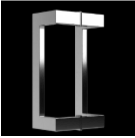
No.401 304 Grade satin stainless steelAvailable in pairs or half pairsAvailable for glass, wood or metal doorsDoor Thickness: 1 3/8" -2" standardDoor Thickness: 2" to 5"+ available Learn More